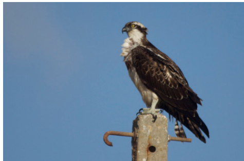
■ Osprey, an iconic species

From nearly 400 bird species listed for Faro District, the majority have already been registered in this area.