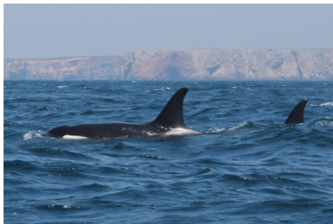
■ Group of Orcas in migration

This is an oceanic species which sometimes can be found a few miles away from the coast. As a resident of temperate and tropical waters from all over the world, it is probably the most abundant pelagic shark species in the Atlantic and Portuguese waters. It is possible to distinguish it by its blue colour and its elongated and slender body, reaching a maximum length of four meters. The blue shark usually feeds on cephalopods (squids) and fish. However, as an opportunist species, it can feed on many other species, if it has