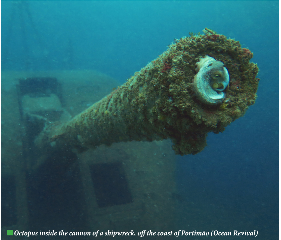
■ Octopus inside the cannon of a shipwreck, off the coast of Portimão (Ocean Revival)