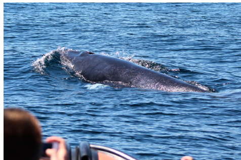
■ Minke whale

Besides these most frequently observed species, blessed tourists can still be presented with an unusual meeting with other less common animals occasionally appearing in these waters. On a lucky day, you may spot: the humpback whale ( Megaptera novaeangliae ) in its annual