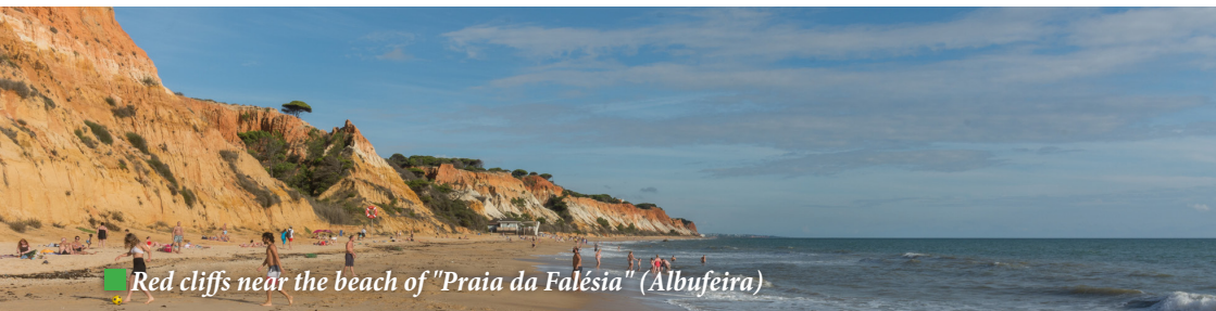
■ Red cliffs near the beach of "Praia da Falésia" (Albufeira)