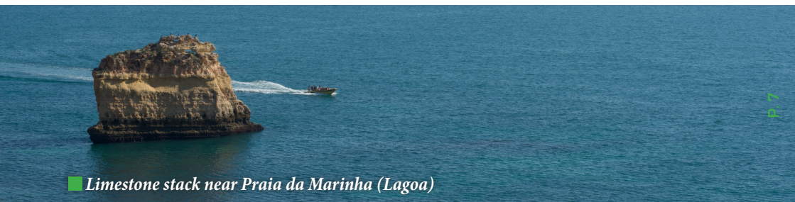
■ Limestone stack near Praia da Marinha (Lagoa)