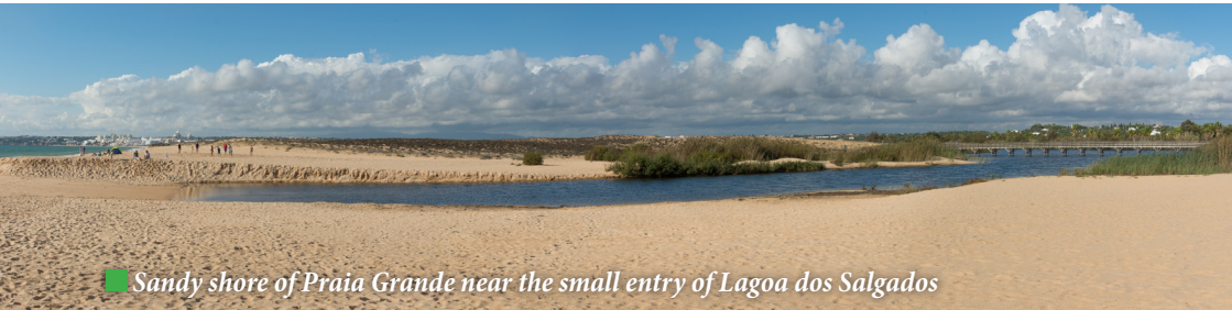
■ Sandy shore of Praia Grande near the small entry of Lagoa dos Salgados