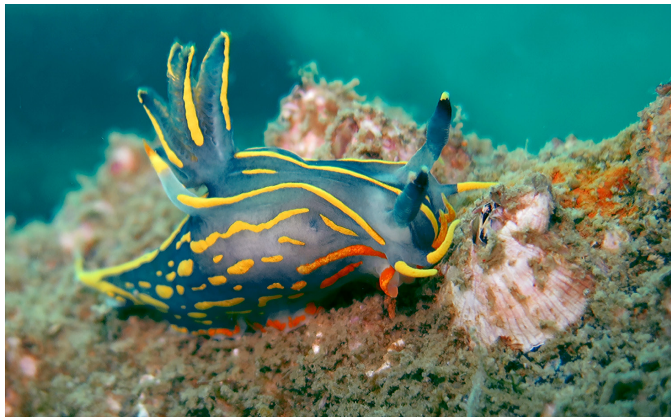
■ Sea slug

the lemon-fish ( Parapristipoma octolineatum ) and the damselfish ( Chromis chromis ).