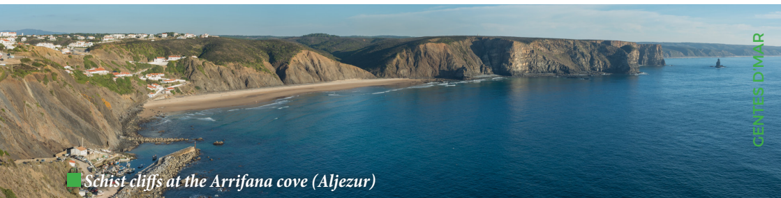
■ Schist cliffs at the Arrifana cove (Aljezur)