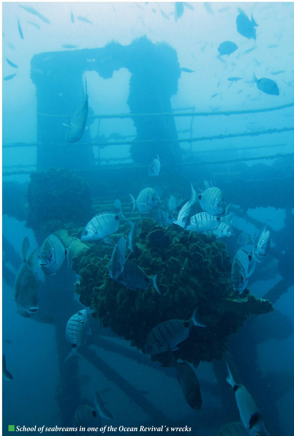
■ School of seabreams in one of the Ocean Revival's wrecks