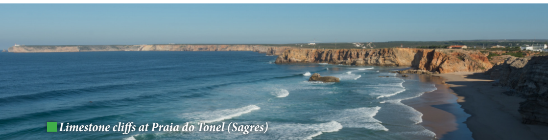
■ Limestone cliffs at Praia do Tonel (Sagres)