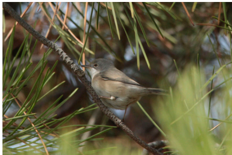
■ Subalpine warbler