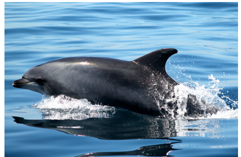
■ Bottlenose dolphin

The common porpoise belongs to a different family of dolphins. They have no snout and have several distinct anatomic and structural traits. They are coastal animals, small and very shy. Their observation is very difficult because they usually do not approach the boats and show an erratic movement, constantly changing direction. They feed close to the bottom, looking for small fish, crustaceans and cephalopods. In the Algarve, they are often spotted along